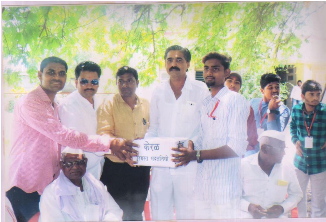
Contribution of student of sociology Department in Rally for raising for Kerala Flood Relief Fund