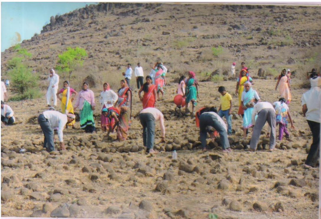
Contribution of staff in Shramdan Shibir organised in Sheri as an event of Pani Foundtion and Water Cup Competition