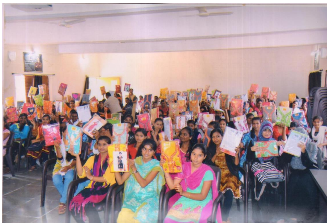
Department of Sociology distributes dresses to girl students on occasion of Birth Day of Hon. Chandrakant Dada Patil