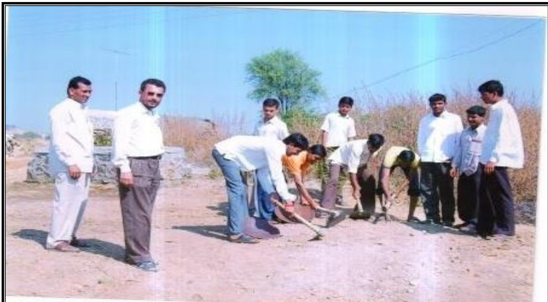
Students of the department of Sociology at Campus beautification Programme.