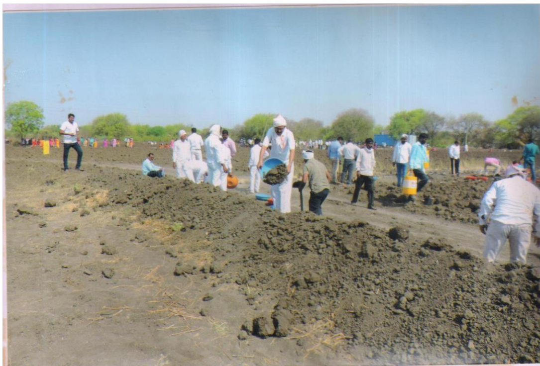
Contribution of Department of Sociology in Shramdan Shibir organised in Kasewadi as a joint venture of NSS and Kasewadi Grampanchayat