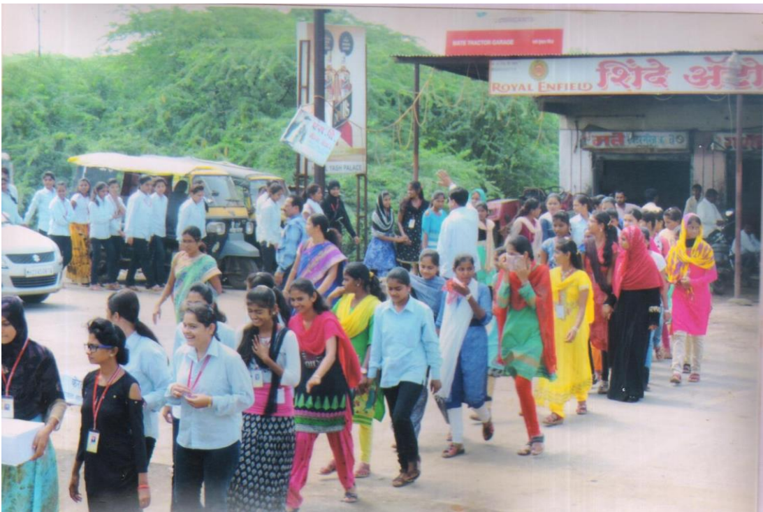
Student participating in fund raising rally to collect Kolhapur Flood Relief Fund