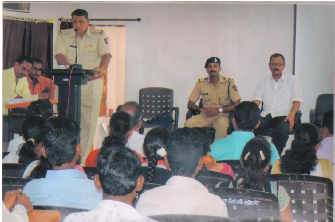
Police Officers interviewed in college auditorium for Civil Services Examinations