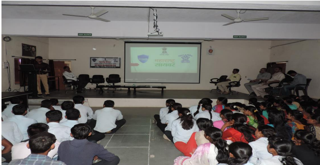
Guest Lecture Organized by Department on Cyber Crime.