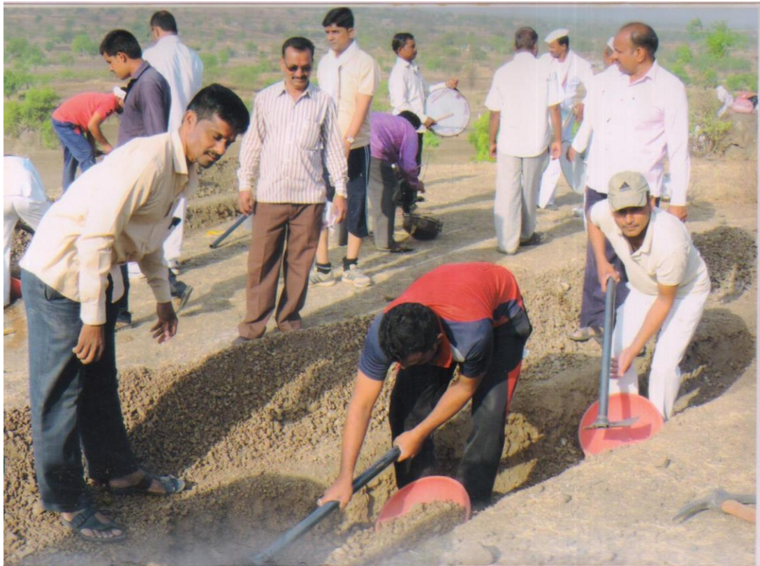
Contribution of staff in Shramdan Shibir organised in Sheri as an event of Pani Foundtion and Water Cup Competition