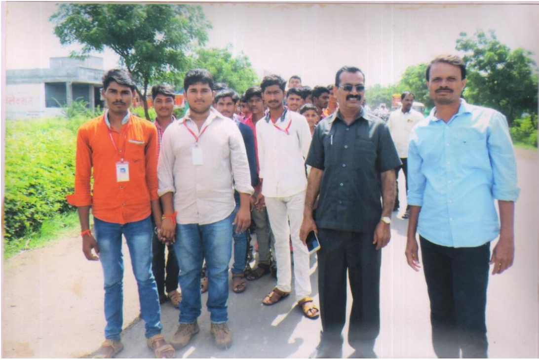
Department of Sociology organised a protest rally in Nirbhaya Gang Rape Case